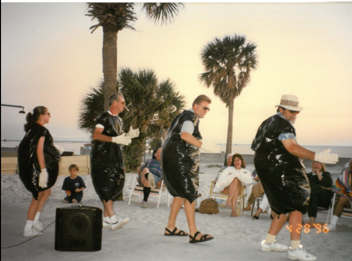
1996 California Raisins @ Beach Weekend

The 50th Anniversary committee of St. Stephen's Church is up and running and has already had a few meetings. In order to help put together a presentation of St. Stephen's through the years, they are asking that each of us look through our photos and see if there are any, with dates, that we could use. If you have some, either move them to a flash drive or bring them into the office and I can scan them for you. Thanks.