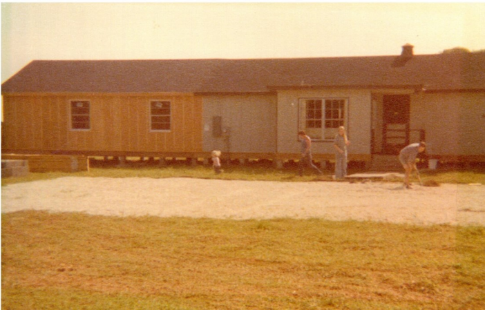
The Community Building/Original Sanctuary in 1975. Also the Garden Chapel

The 50th Anniversary committee of St. Stephen's Church is up and running and has already had a few meetings. In order to help put together a presentation of St. Stephen's through the years, they are asking that each of us look through our photos and see if there are any, with dates, that we could use. If you have some, either move them to a flash drive or bring them into the office and I can scan them for you. Thanks.