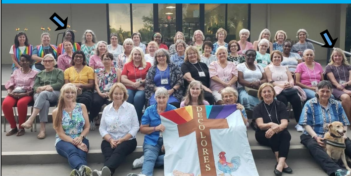
Women's Cursillo 132