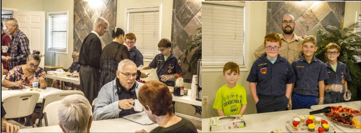
Cub Scout Breakfast last Sunday, the kids were cute and the food was good

The number of cases of Covid-19 are on the rise in Polk County and throughout the United States. The deadline has been extended to get four free at-home COVID-19 tests this fall on COVIDTests.gov . Take a few minutes to order some and keep them on hand.