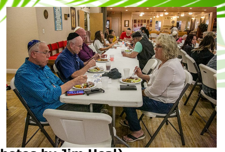
Palm Sunday, 2nd Sunday Brunch and Seder Dinner