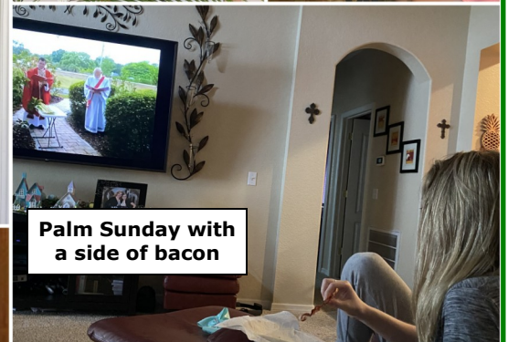
Palm Sunday with a side of bacon