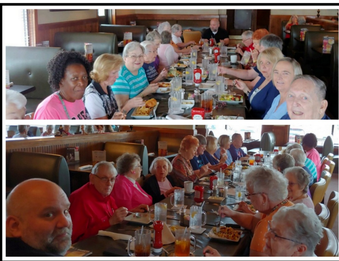
Lunch Bunch enjoying themselves at Ruby Tuesday last Thursday.