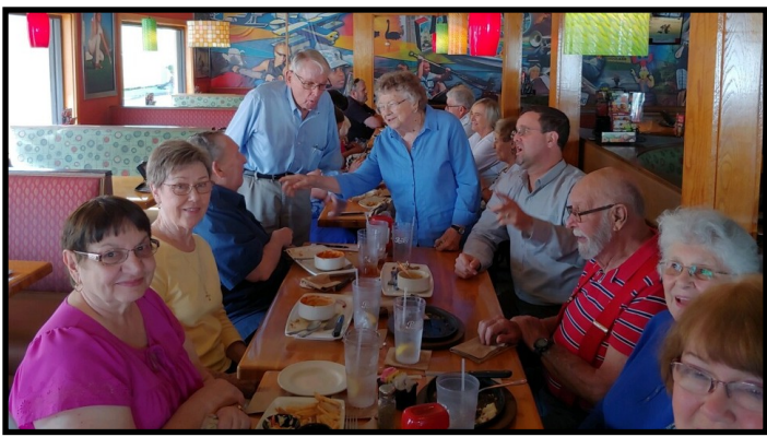
This is the Lunch Bunch enjoying good food and fellowship at Applebee's. Join them next month at Ruby Tuesday.