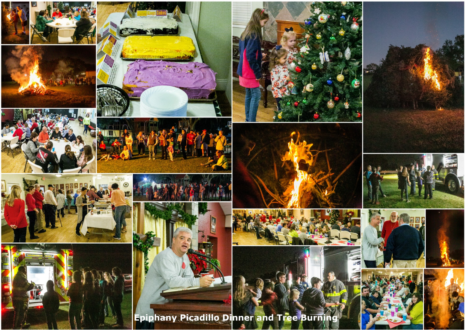
Epiphany Picadillo Dinner and Tree Burning