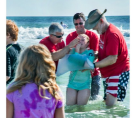
Beach Weekend 2019