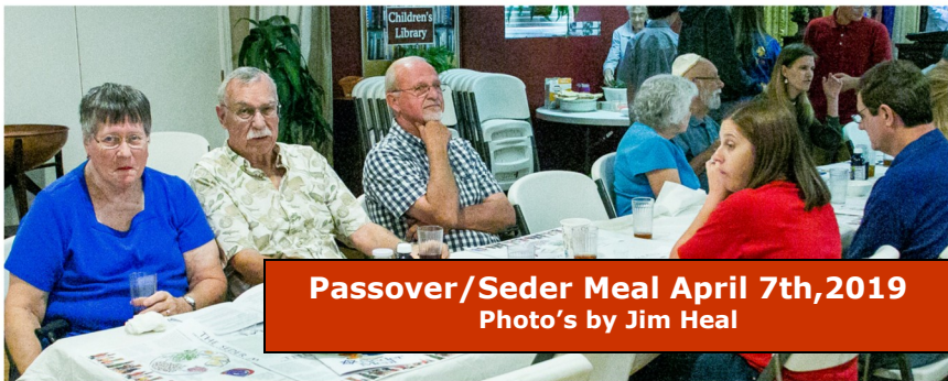
Passover/Seder Meal April 7th,2019