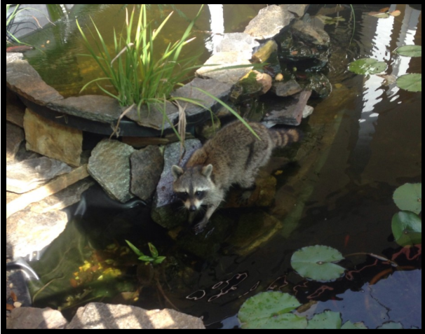
It appears that Mr. Raccoon cannot read the "No Fishing" sign