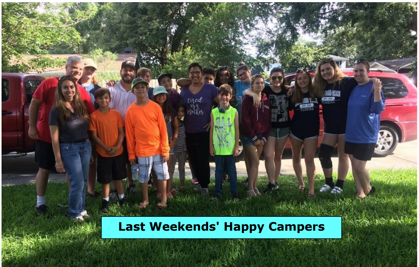
Last Weekends' Happy Campers