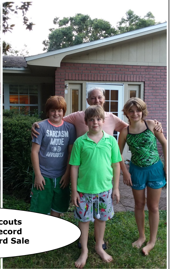
Thankful Family and Scouts After last Saturday's record breaking, $4,254.20, Yard Sale