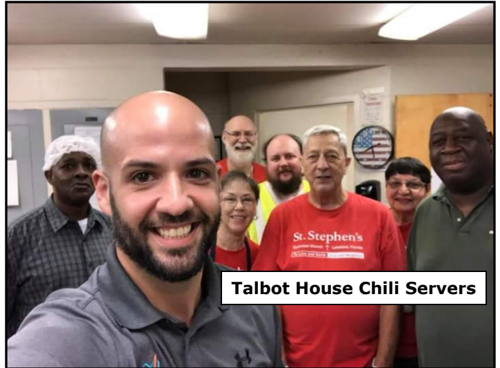
Talbot House Chili Servers