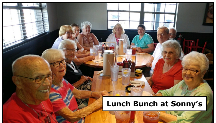
Lunch Bunch at Sonny's

Please wear your Name Tag. If you need one let the office know.