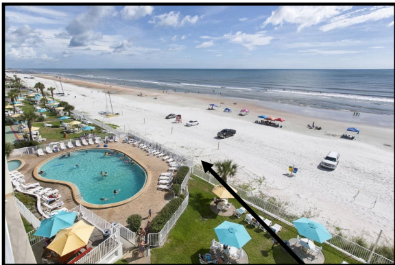
This is where we will spending our 2019 Beach Weekend

Beach Weekend information and sign up poster will be available in the Worship Center for the next two weeks. We need an approximate count of the number and type (s) of rooms to reserve--there are lots of choices. If you are interested in a 2 BR configuration, please note that connecting rooms in the South Tower are the same price as the one 2 BR cottage. The information table will be manned on 8/12 & 8/19, if you have questions. We will then let Perry's know our needs. We are very excited about the response we received at last week's presentation! Remember, we are also looking for someone to be in charge of reservations--let us know if you can help.