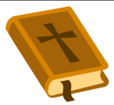
Bible Book Summary of the Week