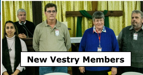
New Vestry Members